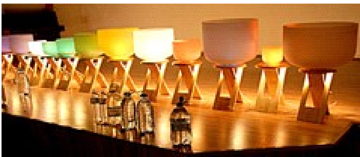
Fig. 1. Crystal bowls with different diameter

Crystal bowls, manufactured from pure quartz crystal, align and harmonize with the human energy field. Their vibrations reinforce the body's natural energy and gently assist in returning the chakra and organ vibrations to their natural harmonious resonances.